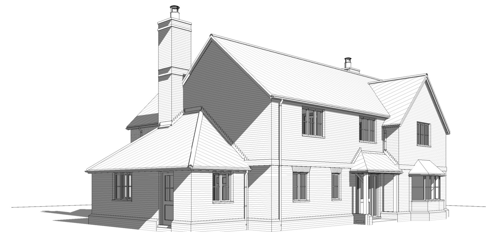
3D View I