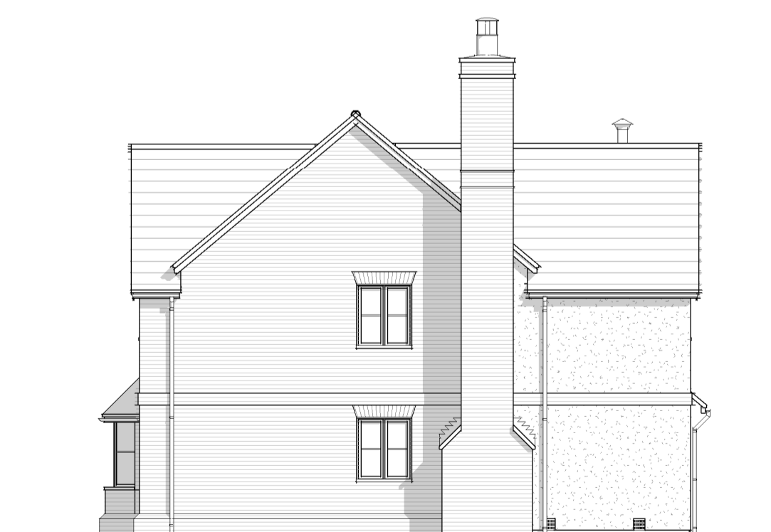
South East Elevation