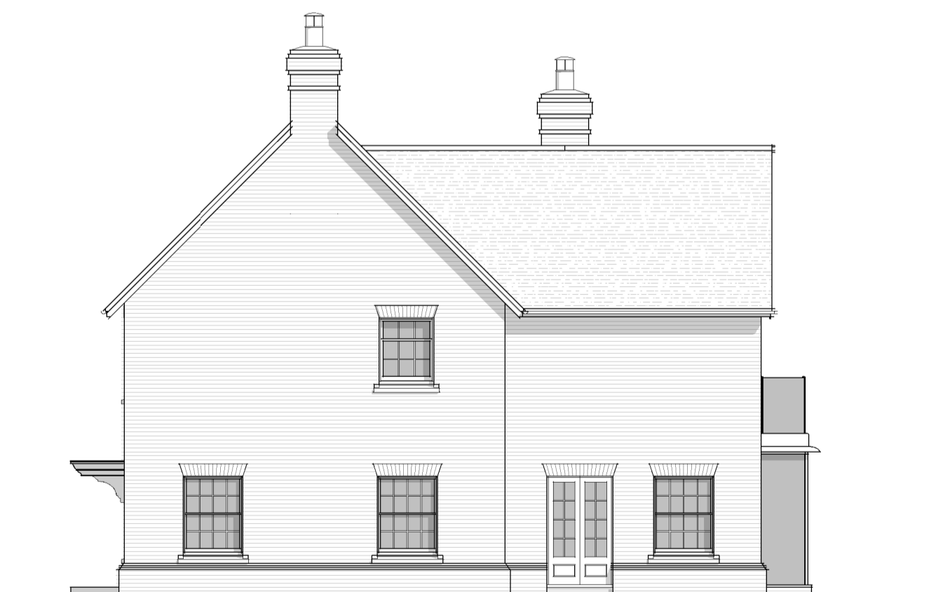
South-East Elevation 1 : 100