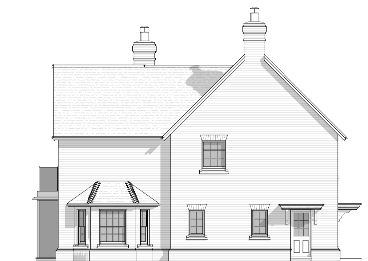
North-West Elevation 1 : 100