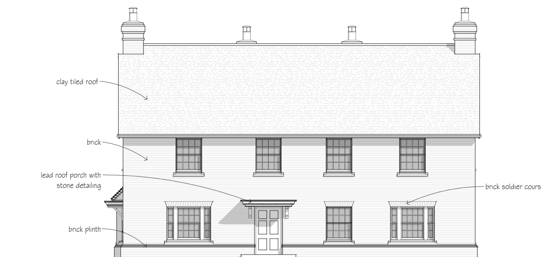
South-West Elevation 1 : 100