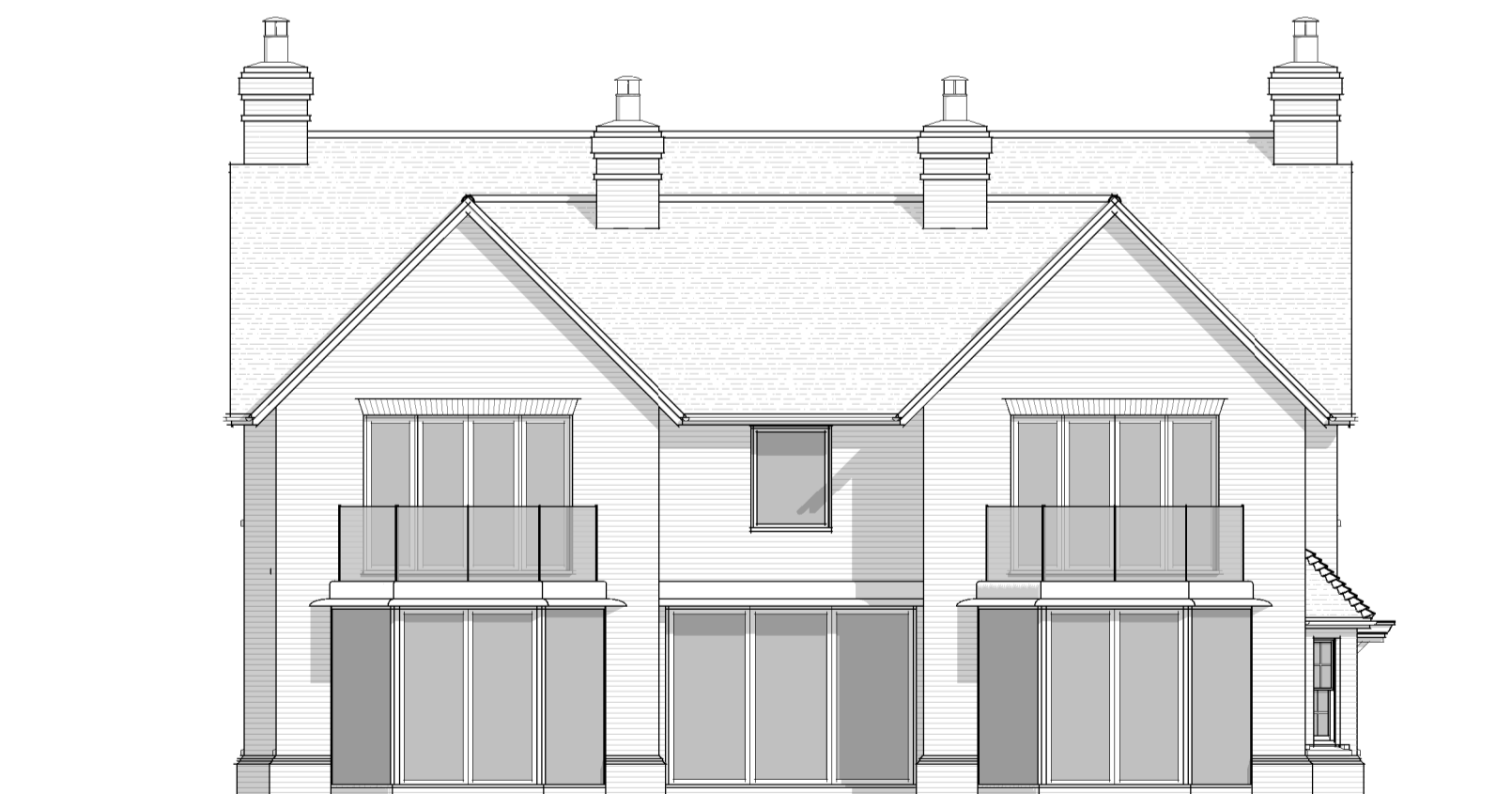
North-East Elevation 1 : 100