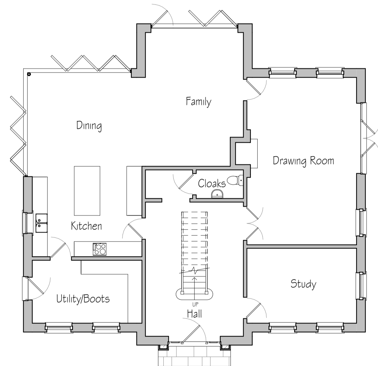
Ground Floor Plan 1 : 100