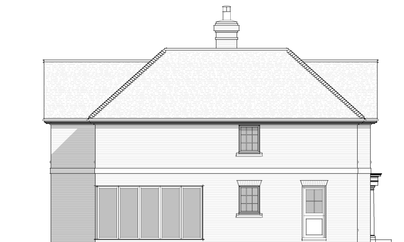
North-East Elevation 1 : 100