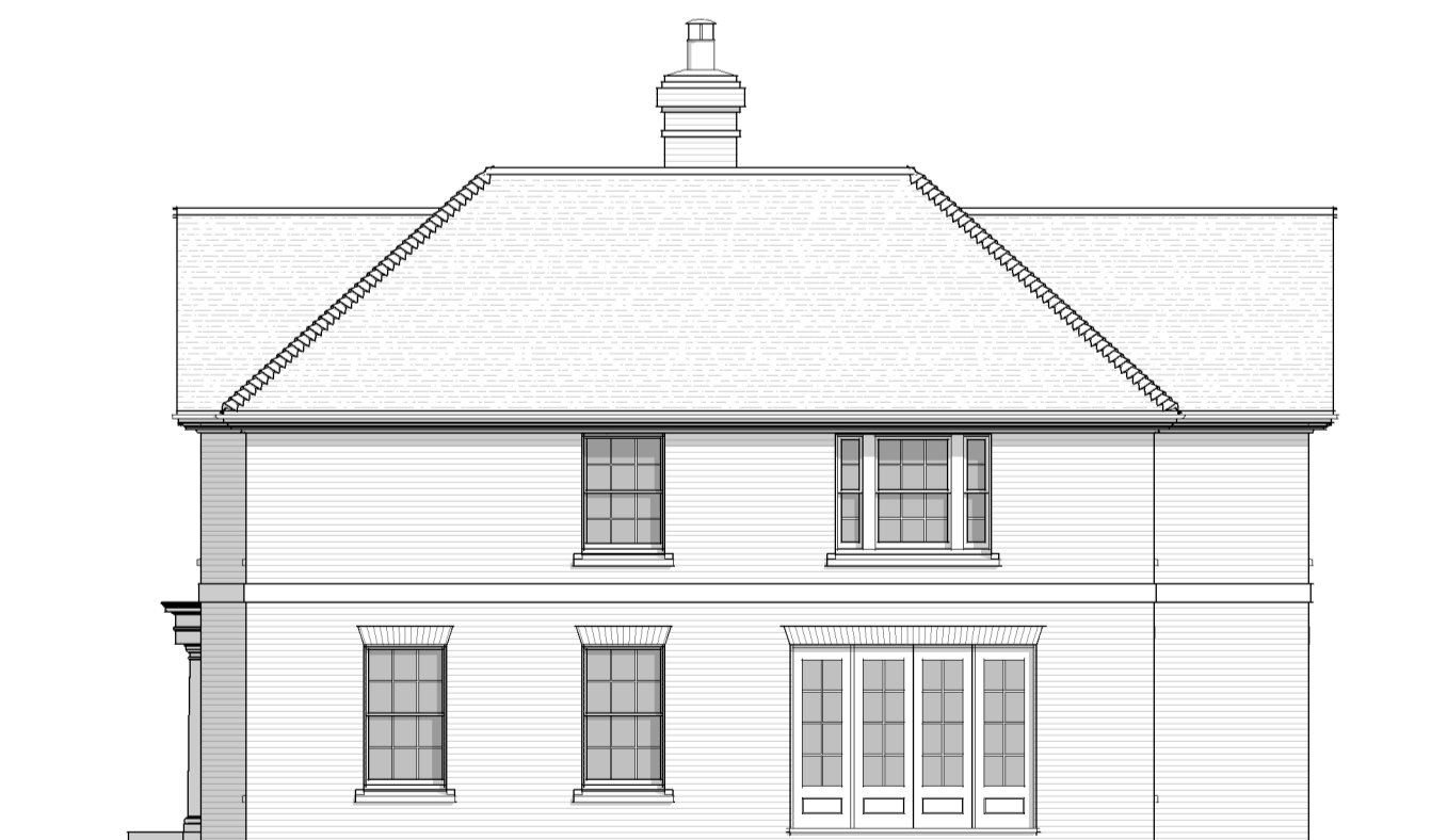
South-West Elevation 1 : 100